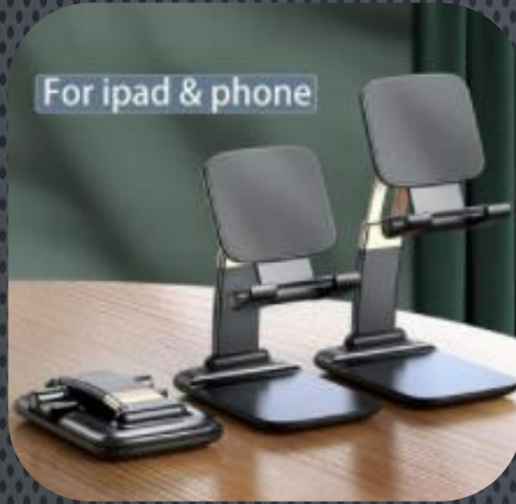
B 402 Foldable Mobile stand