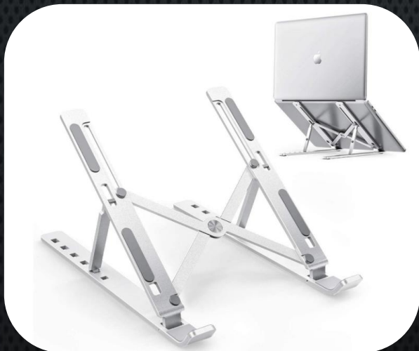
B 406 Metal laptop Stand