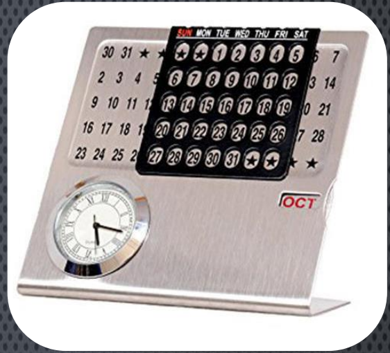
B 409 Steel Watch Lifetime Calendar Size 9x10.5x4 c.m