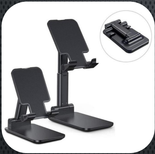
B 404 Foldable Metal Mobile Stand