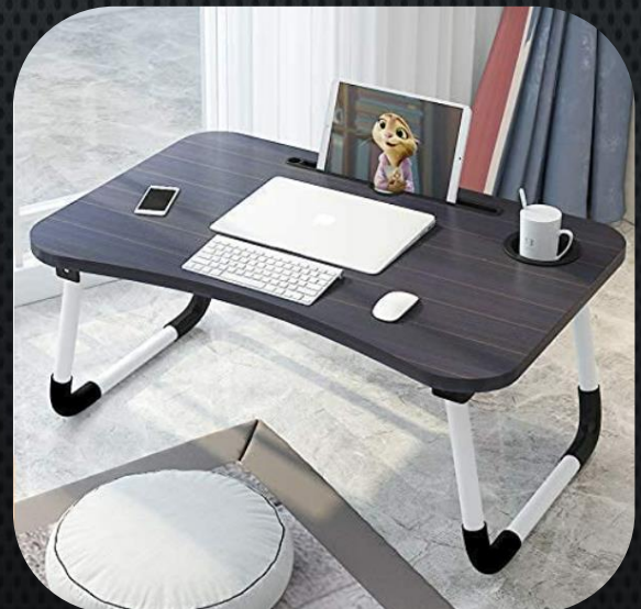
B 407 Laptop Stand