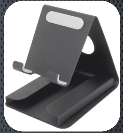
B 403 Card Holder Mobile stand