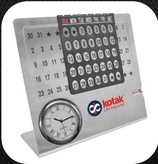
B 412 Steel Watch Lifetime Calendar Size 14x15.5x5 c.m