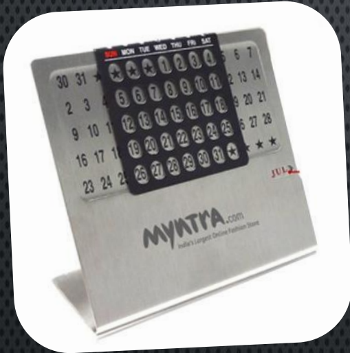
B 410 Steel Lifetime Calendar Size 9x10.5x4 c.m