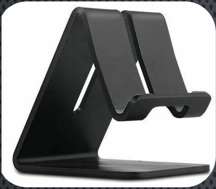
B 401 Metal Mobile Stand