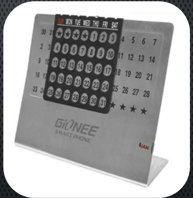
B 411 Steel Lifetime Calendar Size 14x15.5x5 c.m