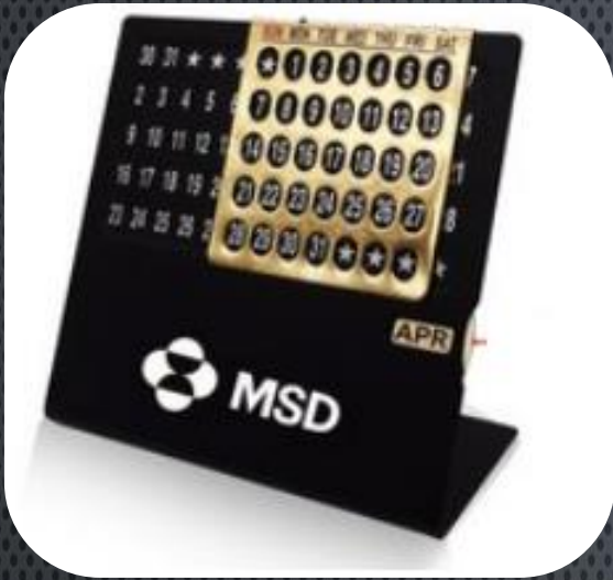
B 408 Steel Lifetime Calendar Size 10x10x4 c.m